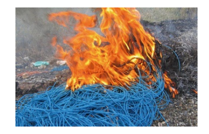
Toxins are released into our air from burning wire.